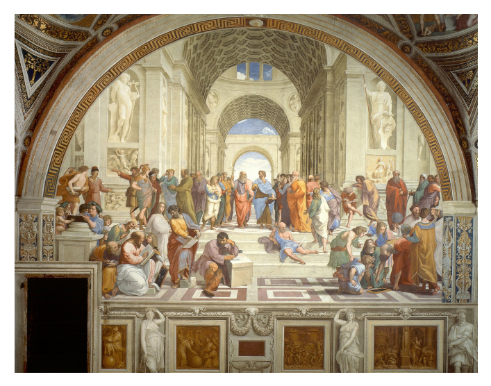
Figure 1. Raphael's celebrated fresco the School of Athens on the wall of Apostolic Palace in Vatican City.

practice and qualifications with others might put their goodwill in danger. Even institutions of the same status can have severe reluctance in joining such a union [4]. For instance, Imperial College London and University College London, two world-renowned universities from England, initiated a merger in a bid to form a large university capable of attracting twice the research fund universities such as Oxford or Cambridge can allure [5]. Although the alliance could help them achieve many benefits, it did not come through due to opposition from management and students of both universities [6].