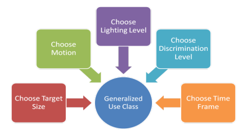
Fig. 1. Classification of video into GUC as proposed by VQiPS.

These parameters form what are referred to as Generalized Use Classes, or GUCs [17]. Fig. 1 is a representation of the GUC determination process.