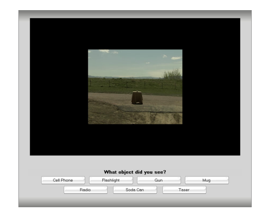
Fig. 2. User interface for subjective target recognition task test.

The accuracy of answers given by subjects was growing