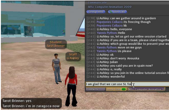
Figure 3. E-mentoring/E-tutoring

advantages, including open correspondence, access to more geographically isolated regions, and efficiency of communication. As a result, students feel that the e-tutoring/e-mentoring systems in the SVW are more attractive and engaging, enabling more thoughtful and deliberate discussions with trust.