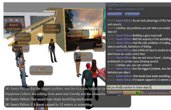
Figure 2. The virtual exhibition event

SVWs, we launched a virtual exhibition in our virtual campus as shown in Figure 2. The feature of 'the learner as content producer' in a SVW allows students to put their visual works (e.g. poster, animation, video) as user-generated content in the virtual exhibition centre. Students can change and replace their exhibits whenever they want. Compared to the on-site gallery show, the virtual exhibition in a SVW has great competitive advantages including low cost, removing the barriers such as limited time and space of exhibition, and being able to reach a much wider audience through the Internet. Furthermore, the learner as content producer in this SVW has greatly spurred students' motivation, enhancing their creativity and productivity. As a result, students are increasingly stimulated into active participation in social events in the intergrated VLE while achieving a student-centred active learning experience.