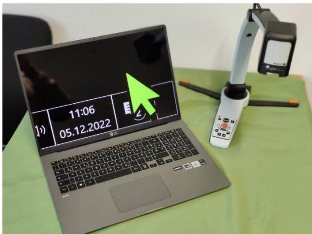
Figure 2. Overhead Camera System in Combination with Multitudinal Magnification.

A mobile solution for all everyday situation is provided by smartphone apps as seen in Figure 3. Inversion of colours does not only allow better conception of shapes and letters, but enables also users with color blindness, which with 10% of the population is one of the most frequent, albeit slight, visual impairments.