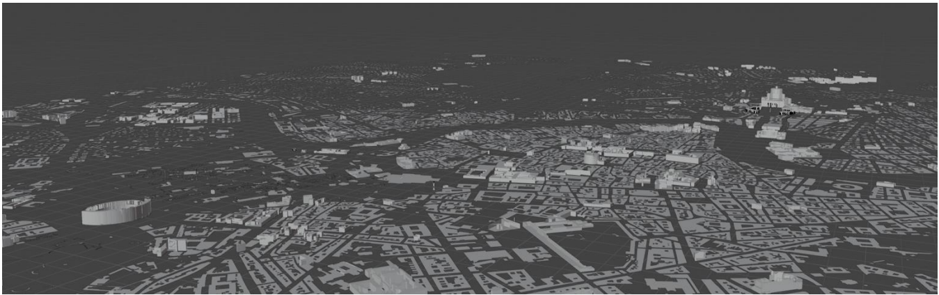
Figure 1. OpenStreetMap raw building data.