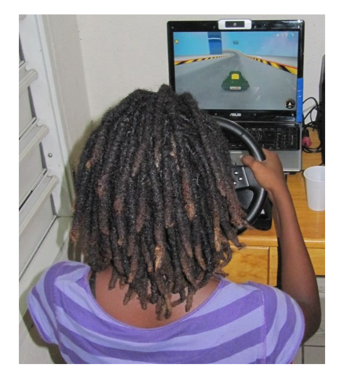
Figure 1. The prototype during a run

For each full lap of the circuit, a vector of 5 components is preserved and will feed the artificial neural network. Those components are (i) the average number of steps per rotation (the steering wheel is analogical), (ii) the number of accidents (collisions and falls), (iii) the total number of actions of the steering wheel, and (iv) the number of changes in direction (e.g., the driver was turning left and is