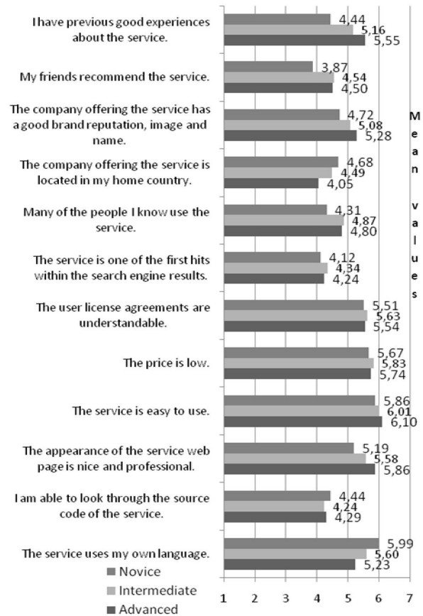
Figure 3. The factors of secure feeling divided by end users' self-evaluated experience within cloud services.

It is interesting, though, that ease of use showed to be of different importance level with different respondent groups. This factor has significantly more importance for the Finns than to the Japanese respondents. Some of this may be explained by the fact that this factor was more important for the advanced users of cloud services than for the novice users, and in Finland a considerably larger percentage of respondents evaluated themselves to be advanced cloud service users than in Japan.