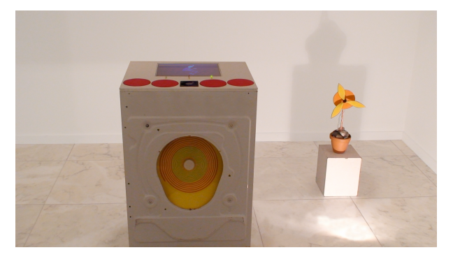
Figure 3 – Inversus installation presented in a art exhibition: Cheia, Póvoa do Varzim, Portugal.

communication with an unknown interface. We used some design conventions, such as shape, color or spatial distribution of the controllers that provided some interaction clues.