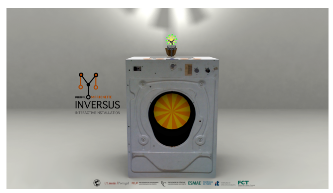
Figure 1 - 3D simulation of the machine with the shadow of the flower projected on the wall.

on human interaction the machine generates animation in the physical and in the virtual space in the mechanical and in the digital domain enhancing the user experience. This audiovisual instrument made from a washing machine spins a