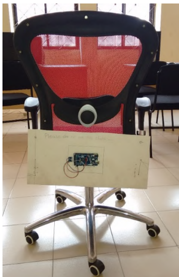
Figure 4. Back View of Chair