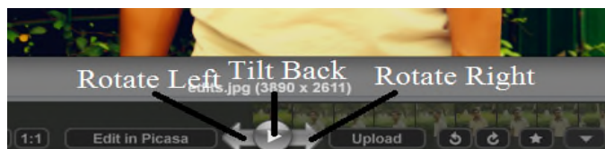
Figure 2. Definition of gestures