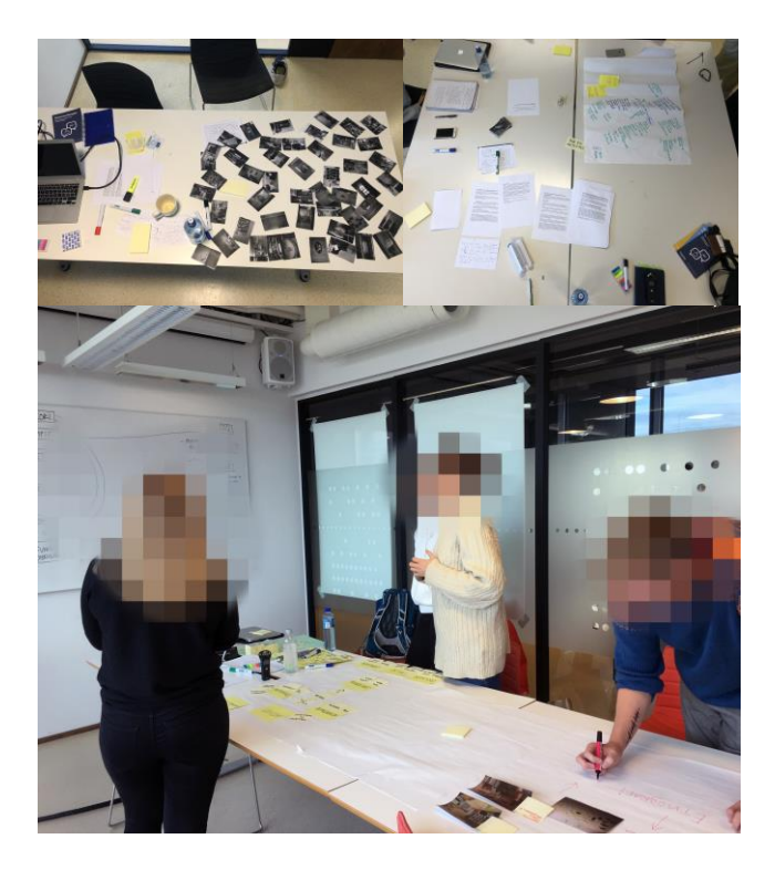
Figure 2. Examples of raw data (top row) used in the analysis (bottom row)

In the first analysis, we wanted to analyze to what degree our immersion strategy actually provided contextual insight. The individual coding of the same data set performed by the two researchers in the first exploratory workshop yielded a total of 64 overlapping first-order codes shared by the two coders. The data included in this analysis consisted of photographs, observation notes, elicitation diary entries, and documents from the activity center.