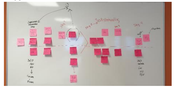
Figure 1. The first version of the journey map illustrating the steps of the case handling.

Figure 1 shows the result of the journey map that was cocreated together with the case handlers of the two sections, using post-its and markers on a whiteboard.