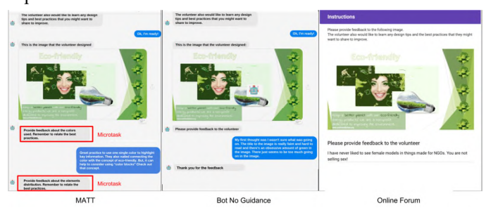
Figure 3. Feedback interfaces: 1) MATT, 2) Bot No-Guidance 3) Online Forum.

We recruited real word learners and experts using social media. To recruit learners, we posted on Facebook groups related to learning design, inviting people to our live deployment. Learners were offered the opportunity to potentially use new interfaces and obtain feedback from experts on their designs. To recruit experts, we used LinkedIn's search to find and invite individuals who stated they worked in design-related areas and identified themselves as experts. We recruited 153 learners and 76 experts. Each of our three interfaces was used by a total of 51 learners and 25 experts.