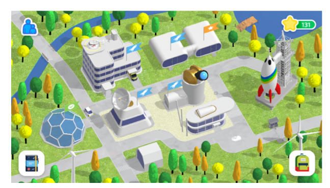
Figure 1. The space campus with game and activity buildings.

The starting page or the "home page" of the application is the space campus from which six mini-games can be reached (Figure 1). The app includes four 3D games: the Memory game, the Metal game, the Scanning game and the Balance game, and two augmented reality (AR, a real-world environment that has been enhanced by computer-generated perceptual information) games: the AR Comparison game and the AR Scaling game.