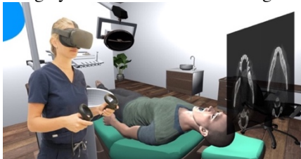
Figure 1. VR for implant surgery simulation

Our project is inspired by the work done by a previous research group [4]. In that project, authors implemented VR for implant surgery simulation as shown in Figure 1.