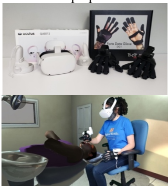
Figure 2. VR Learning with haptic glove

To tackle the tactile/haptic limitations from previous study, our current research team explored the implementation of haptic device into VR learning module, specifically cavities preparation training. In the beginning, the authors tried to integrate haptic gloves as shown in Figure 2. Since the primary goal in the cavity preparation simulation is to drill into a tooth, the authors observed that the haptic gloves were not an appropriate input device for an accurate simulation because it has no resistance feel. The glove also proved to be unintuitive for new users, as well as generally unrealistic for the purposes of the simulation.