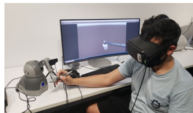
Figure 4. VR and haptic integration

The purpose of this project was to simulate dental training, specifically tooth cavities preparation, with virtual reality and haptic feedback as shown in Figure 4. This would enable dental schools to provide their students with the real life experience that they require without spending the usual amount of time and resources needed to teach them in person. When students are given training in a virtual environment we expect it can help them to become more confident when working and practicing in the real world, potentially reducing or eliminating mistakes. This also gives students more time and accessibility to practice skills they've learned in classes. Techniques that need many hours of practice to master are more easily rehearsed with a virtual reality program that can be used anytime outside of the classroom.