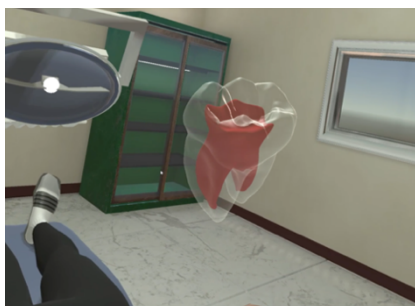
Figure 7. Transparency adjustment feature