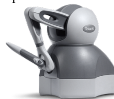
Figure 3. 3D Systems touch haptic pen

to simulate the stylus coming into contact with an object in the virtual world. The haptic pen provides a more realistic approximation of using a handheld drill, while making it easier for the user to interact with the dentistry experience. The combination of rumble motors and locking arms could simulate tooth drilling, largely because the user is holding an object in the physical world that they are also using in the virtual realm to manipulate the tooth.