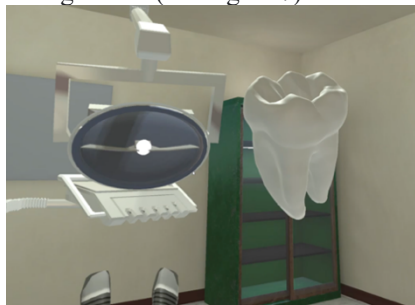
Figure 6. 'Pop-through' feature to analyze drill result

To complement the training session, the authors offered a "pop-through" feature that enables users to pop through the drilled tooth and analyze their result as shown in Figure 6. When user in this state, they also have an option to change the transparency of the dentin layer. This will allow them to compare their drill result with the overall tooth anatomy structure, including nerves (see Figure 7)