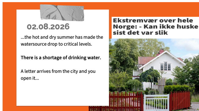
Figure 2. Sustainability design fiction scenario

The participants receive a bill with a detailed overview of the household's water consumption, broken down into days. They are tasked with discussing how this information may possibly be used / misused as illustrated in Figure 3. They can then delete, change, or add to the bill based on what they come up with.