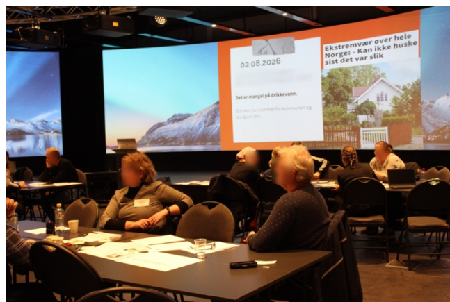
Figure 4. Groups discussing scenarios for sustainable water usage

and how they came up with alternative visions regarding the use of digital water meters that diverged from the ones proposed by the scenarios.