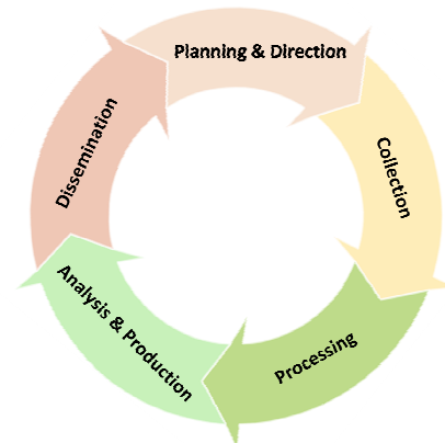
Figure 1. The intelligence cycle (adapted from [2])

The day-to-day activities of the intelligence analyst are driven by the intelligence cycle, illustrated in Figure 1. The intelligence cycle is defined as “the process of developing raw information into finished intelligence for policymakers to use in decision-making and action” [3]. The intelligence cycle encompasses many sensemaking tasks that the intelligence analyst must accomplish in an iterative fashion. Such tasks include: gathering relevant information; representing and organizing the information in a schematic way that will ease the analysis process; developing an understanding of the situation by subjecting the information to various hypotheses; and producing intelligence packages and recommendations for courses of action.