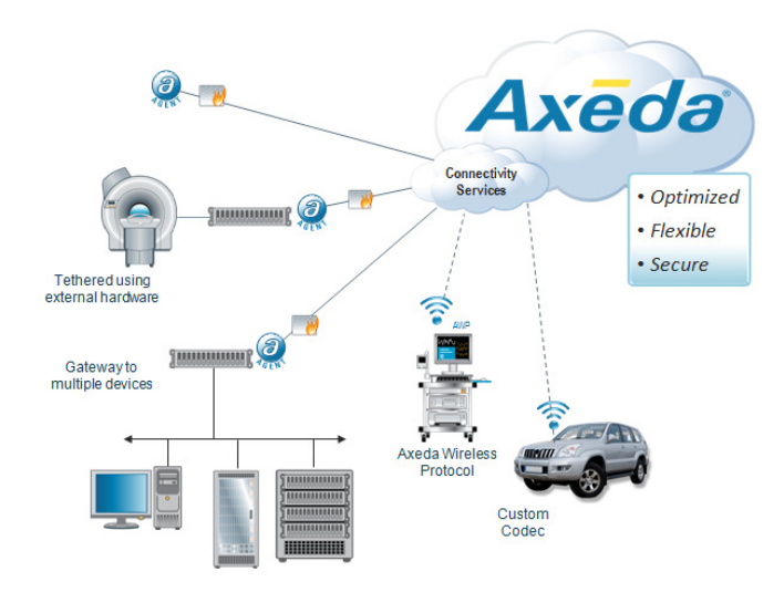
Figure 3. Axeda platform

Note that this system is actually very far from the European standards, despite the fact that it is also based on REST and SOAP as the ETSI standards. But in the same time AT&T has selected it as default M2M platform.