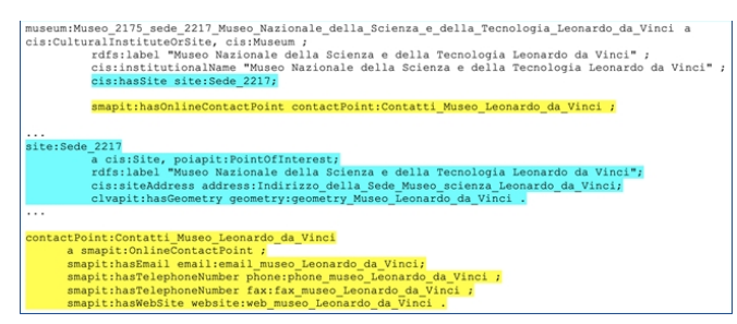
Figure 3. Excerpt of the Lombard Museum of Science and Technology in RDF Turtle

It is important to note that two museums, initially available in different formats, are finally described in a common interoperable RDF format. This translation process leads, in this case, to information loss because there is not a full correspondence between the initial format and the ontological one. The ontology contains more classes and properties than the original file format; on the other hand, it is not enough expressive to represent all fields of the original data sources. For instance, the number of visitors is not included in the Cultural-ON ontology.