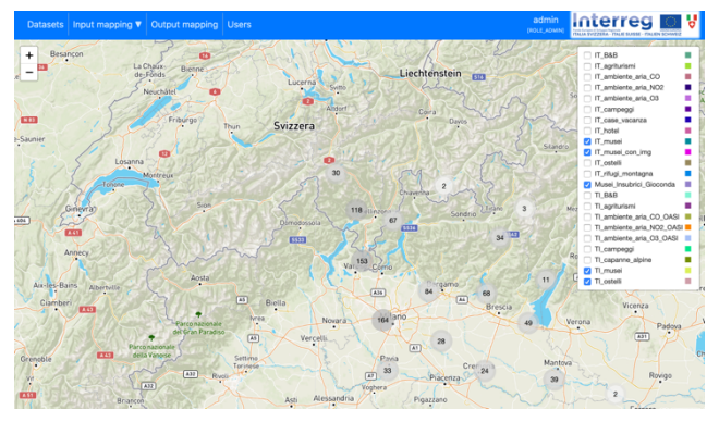
Figure 7. LOD Datasets visualized in the map

By clicking on the "map view" button it is possible to visualize geo-locable data on the map as shown in Figure 7.