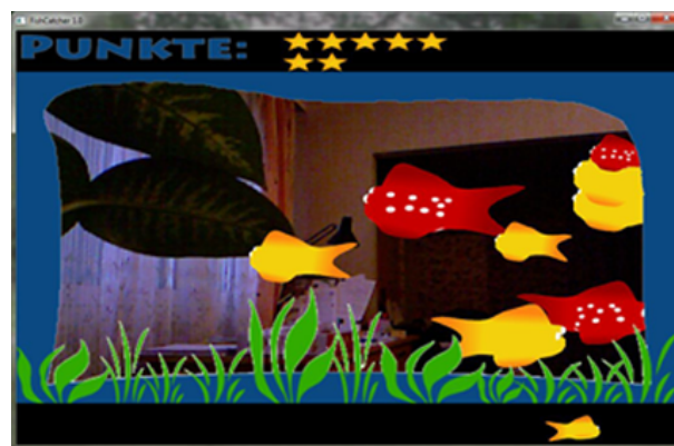
Fig. 1. Yellow and red fish are swimming, the stars specify the current score and the little fish at the bottom shows the remaining time

One game lasts 30 seconds, and, during this time, the players try to catch as many yellow fish as possible, while avoiding touching the red fish. The remaining time is shown by a small yellow fish at the bottom of the window. When the game starts the fish is located leftmost at the bottom. During the 30 seconds, this fish moves to the right side. After that time, the fish is located rightmost, which signifies that the game is over. After one game is over the users can take a break and decide whether they want to continue playing or not. Furthermore, the player can choose between three different levels of difficulty. The easiest one contains the fewest amount of yellow fish and also of red ones, while the most difficult level consists of the biggest number of yellow and red fish, respectively. Another difference between those three levels is the velocity and the size of the fish. The fish in the simplest level are swimming slower and are bigger than the fish of the most complex level. In the medium level, the numbers of fish, the velocity as well as their size are in between the two others.