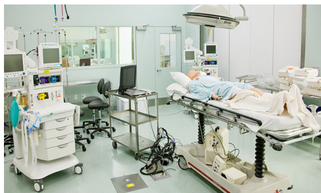
Figure 2. Center for Immersive and Simulation-based Learning

A range of studies has demonstrated the use of head-mounted cameras for clinical use and education. Bizzotto et al. [10], for instance, used the GoPro HERO3 in percutaneous, minimally invasive, and open surgeries with high image quality and resolution. Several reports document the live two-way broadcasts of patient surgeries by doctors wearing Glass in the operating room [11][12].