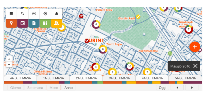
Figure 3. The timeline is slit in steps easy making it easier to read for users, i.e. weeks in a month. Each step shows the ratio of timed entity types.

With this new setup, users can consider much more intuitive the interaction with the time-line clicking on a step to zoom in and focus the map on the timeframe they wanted.