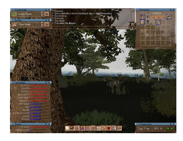
Figure 2. Original MMOG screenshot.