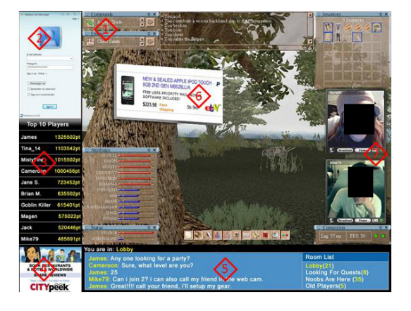
Figure 3. IGIT-modified MMOG screenshot.