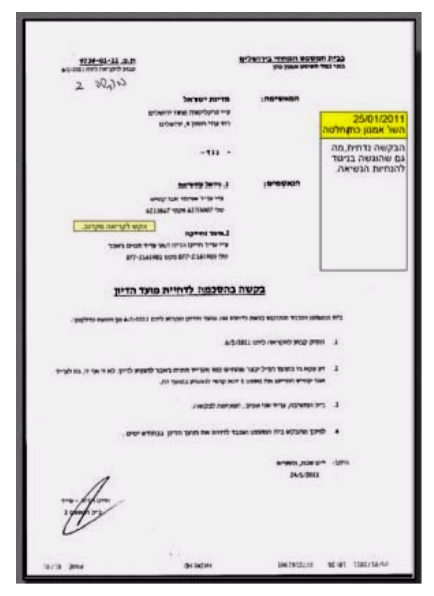
Figure 3. Invalid Electronic "Post-it" Decision Record of the Jerusalem District Court

The record belongs to the file of State of Israel v Awisat et al (9739-01-11) in the Jerusalem District Court. The background document, is a motion, titled: "Request by Joint Stipulation for Continuation of Hearing Date." The Motion record is graphically signed by the attorney who filed the motion in the lower left corner. The small framed image, superimposed on the Motion records in the upper right corner, is a "Post-it Decision". The yellow heading states: