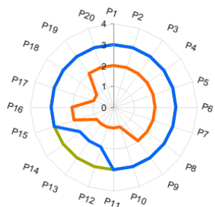
Figure 1. Radial chart of the LOWA operator.