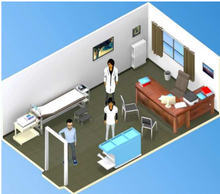
Figure 3. The doctor training game by Succubus Interactive

In all these cases, technical development would incur substantial costs in time or outsourcing, and could result in a game-based approach being disregarded due to these prohibitive factors. With the mEditor however, the tutor can repurpose the game so as to use it in a scenario where the patient has a different condition without as much need for technical development or significant investment. For more extensive repurposing some understanding of boolean logic and functions is still needed.