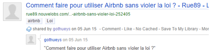
Figure 2 Atonal post – Typical example of a student’s bookmark in a Diigo group [15]

These two posts are indicative of current social bookmarking trends: the “expert” will post a minimum set of information, using a rich set of tags but shows no further engagement in describing the bookmarked resource. The “student” provides the bookmark with a minimum set of tags and description. Both posts expect the potential user to have a specific interest on the topic in order to pursue further with their reading or reuse.