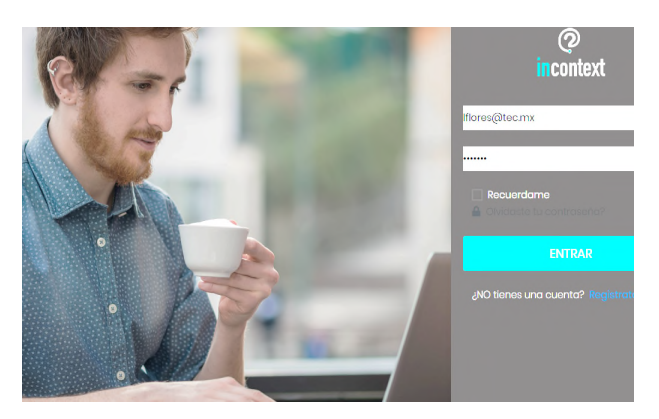
Figure 1. Access screen to the app.

This initial review carried out was qualitative. We compared the research reports and the news stories that students prepared before using the application with the work they did after using it and considered some possible improvements in the tasks. In the case of research reports, better results were observed in two specific respects (Table I), namely, the manifest presence of the research objective and the demographic data of the study participants.