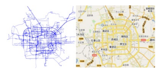
Figure 3. Coverage of the city by taxis; (left) the accumulated traces of ten taxis in one day (7 am - 9 pm)

This main metropolitan sensing network has a large number of sensor nodes which work in a distributed manner, so that the low cost design and energy efficiency protocols are the main features of this network. Differing from the conventional sensor networks whose protocol stack is composed of four layers, we designed a six-layer protocol stack, see Figure 2. The MAC and PHY layer are compliant to IEEE 802.15.4. We replace the ROUTE layer with IP layer which is running IPv6 protocol. Moreover, the node can be