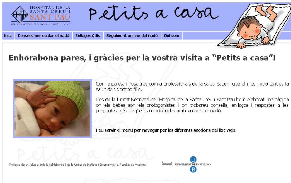
Figure 1. eNHCP home page screenshot. Translation from original version in Catalan: Header : “Babies at home”. Menu-bar : “Home”, “Tips for baby care”, “Useful links”, “Online baby follow-up”, “About us”. Content : ” Congratulations, parents, and thank you for your visit to ‘Babies at home’! You as parents, and we as health professionals, know that the most important thing is the health of your children. From the Neonatal Unit at the Hospital de la Santa Creu i Sant Pau we have created a page where the babies are the stars and you will find tips, links and answers to frequently asked questions regarding baby care. Use the menu to navigate to different sections of the website.”, “Project developed with the collaboration of the Unit of Biophysics and Bioengineering, Faculty of Medicine, University of Barcelona.”

pilot experiment with a Nurse-led Web Chat Triage produced positive reactions from patients [6]. Web-based tools for the support of chronic disease management, such as dyspnea in COPD patients [7], or for educational intervention, such as Web-assisted tobacco control [8], are recent examples of successful telenursing applications using the Web.