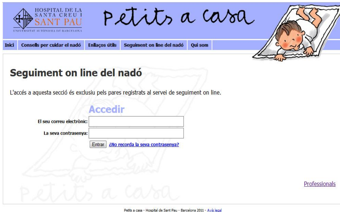
Figure 2. eNHCP “Online baby follow-up” page screenshot. By logging in, parents can access to their exclusive area. Nurses and healthcare professionals can access to their special area by clicking to the link in the lower right corner of the page. Translation from original version in Catalan: Header : “Babies at home”. Menu-bar : “Home”, “Tips for baby care”, “Useful links”, “Online baby follow-up”, “About us”. Content : “Online baby follow-up. Access to this section is exclusively for parents registered to the online baby follow-up service.”, “Login. Your e-mail address. Your password. Enter.”, “Forgot your password?”, “Healthcare professionals”.

program for newborn patients after discharge. The application developed essentially comprises a web service managed by the NHCP nurses, which provides high-quality educational information about neonatal care to new parents and baby monitoring through a survey that parents fill in periodically. The aim is to relieve the pressure on the healthcare system caused by additional visits, reduce hospitalization and enhance parents’ empowerment and satisfaction.