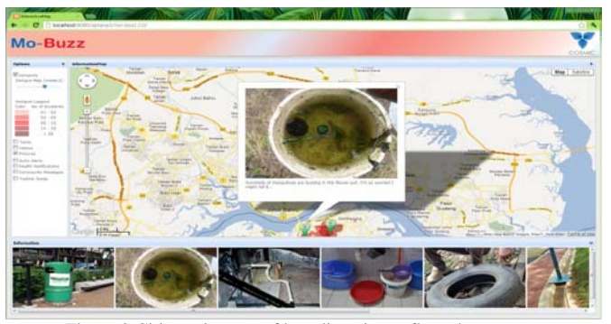
Figure 2.Citizens images of breeding sites reflected on maps

The repository of outbreak information based on weather and citizen data is used to disseminate health messages to both individuals and communities. At the individual level, citizens receive tailored messages based on their input to the system. For instance, a citizen reporting malarial symptoms to MoBuzz will instantly receive a complete information guide on Dengue symptoms, and cues to various preventive actions. At the community level, the system will automatically send health education messages to communities/zones (Fig. 5) that are highlighted on the maps as possible hotspots. Public health surveillance efforts are