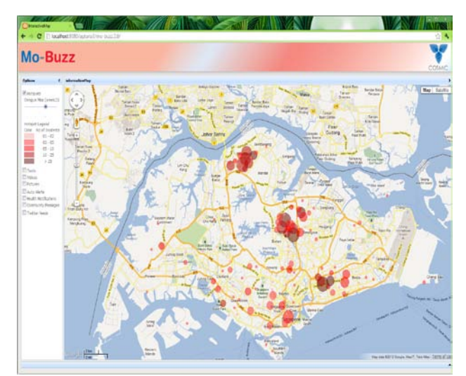
Figure 1. Prototype display of Dengue hotspots in Singapore

Let us take Singapore as an example of a city plagued by Dengue. The intention is to develop a color-coded early warning system that displays Dengue hotspots by generating predictive maps (Fig. 2) made available to both health authorities and the public on mobile devices. Raw weatherrelated information such as rain, temperature and humidity is processed using predictive disease modeling that feeds into an automated system which generates predictive maps of Dengue hotspots. What distinguishes this project from other similar crowd sourcing and crowd informatics platforms is the integration of a disease modeling and simulation component. Here, we build a hierarchy of spatiotemporal epidemic models.