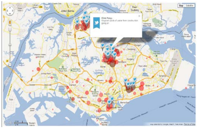
Figure 3.Risk information sent by citizens through Twitter feeds are displayed on the maps