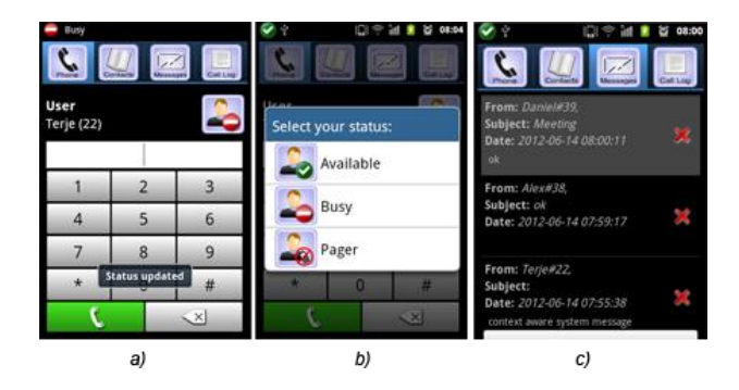
Figure 2: a) CallMeSmart SoftPhone keypad, b) The dialog box from which the user can switch the phone's operating mode manually, c) the Message List

CallMeSmart SoftPhone is a context-aware SoftPhone, based on the Android operating system, specifically designed for hospital usage. The system have been tested through scenarios', experienced during the first authors fieldwork [3], in our context-sensitive laboratory at Tromsø Telemedicine Laboratory (TTL) hosted by Norwegian Centre for Integrated Care and Telemedicine (NST). Together with the context-aware system, CMS [9], on which it relies on, it is able to change its behavior according the context of the user carrying the device. It supports three different operating modes which automatically is controlled by CMS, but can be manually overridden by the users: "Available", "Busy" and "Pager Mode". The functionality is the same as on the DECT phones in [9]. The Available mode makes the phone fully reachable both for calls and messages with the ringer on. In busy mode the phone receives only calls that have been forced by the caller for emergency reasons. And in pager mode, the phone can only be paged through standard text-based messages sending the callers number/name. The CMS SoftPhone also provides a Bluetooth Tracking module, which allows automatic