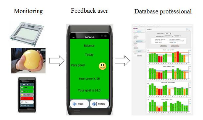
Figure 1. Monitoring and feedback system

process, the system was fine-tuned to the needs and requirements of the end users as much as possible. Taking human and other non-technology issues into consideration during the development process increases the usability and acceptability of the technology [15, 16]. The aim of this pilot study was to test the usability of the bathroom scale and the mobile phone in the daily lives of five elderly people. This small sample size was chosen because according to Nielsen et al. this should be sufficient to identify about 80% of the usability problems of a system [17]. The pilot study only focused on the usability of the system as experienced by elderly people and not on the usability of the database by health care professionals. Unfortunately the usability of the grip ball could not be tested yet due to problems in its production process.