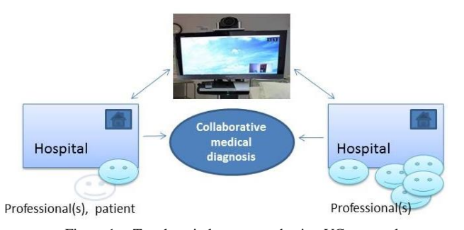
Figure 1. Two hospitals connected using VC as a tool.

There are three contexts in this study: contexts a and b represent hospitals with pre-planned use, and c represents VC in unplanned/acute situations. Figure 1 illustrates how one hospital with one or several general practitioners (GPs) or specialists (coloured faces), with or without patient participation (transparent face), is connected to another hospital using VC as a tool for collaborative medical diagnosis. Traditionally, the professionals in these local hospitals seek a second opinion from the larger specialist hospital over the telephone. VC replaces or supplements the use of the telephone for these activities.