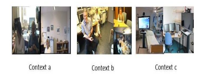
Figure 2. Organisation of the VC in all contexts.