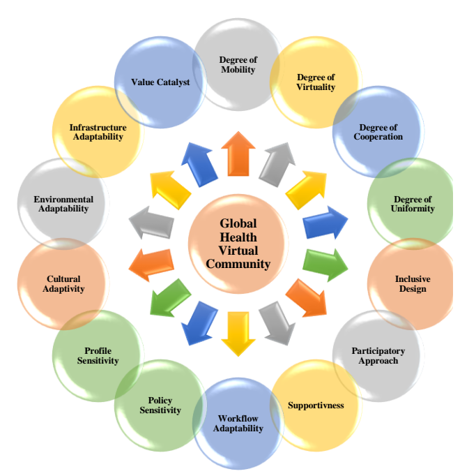
Figure 1. A Global Health Virtual Community Model

El Morr has suggested a model for collaborative virtual communities [10, 44] and developed it later to encompass global health virtual communities [12], and suggested a model shown in Figure 1.