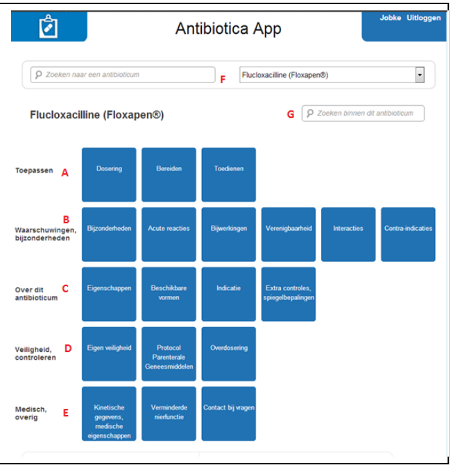
Figure 1. Screenshot of antibiotic overview page. A: task instructions, B:important information and warnings, C: general or background information, D: Safety checks and quality control, E: information for specialists and medical background, F: search field for antibiotic or select from list, G: search all pages (per antibiotic).

By providing easily accessible information, nurses may be better equipped to perform antibiotic related tasks, and are able to recognize and address instances of suboptimal