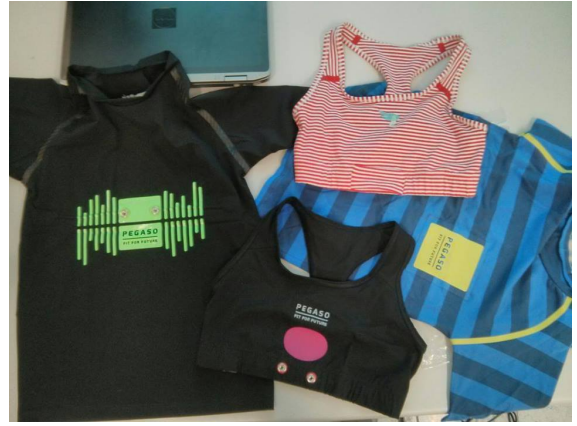
Figure 1. Initial set of T-shirts developed in the PEGASO project

expected. The "technical" fabric - which had been selected as very suitable for sports apparels - turned out to be very little stretchable reducing significantly the wearability and comfort. Figure 1 below shows the first set of T-shirts developed within the PEGASO project and shown to the students.