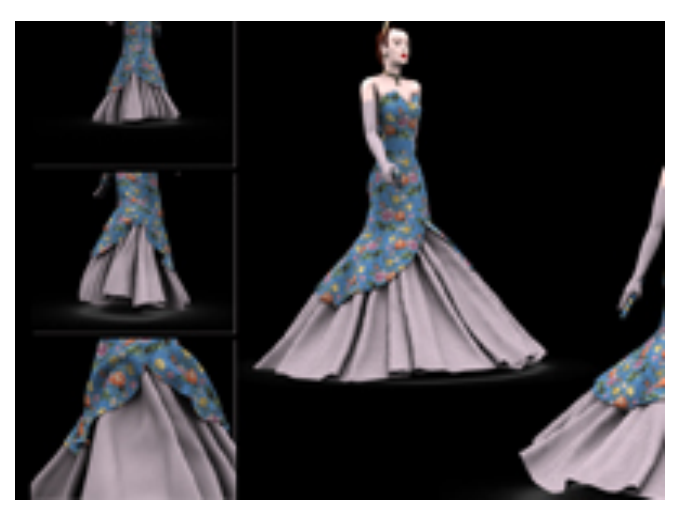
Figure 3. Virtual Clothing – use of MIRACloth tool (source MIRALab – University of Geneva)

In the academic environment, many relevant results are available that can be used to develop a user experience in which teen-ager can be engaged in the design of the smart Tshirt, without having to develop costly real prototypes.