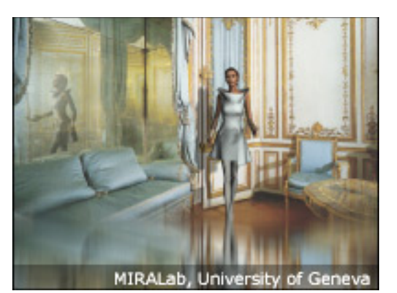
Figure 4. Project "Dreams of a Model"