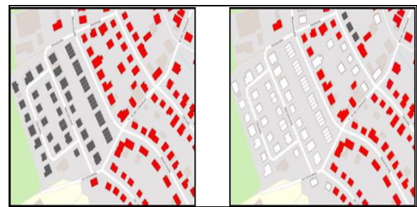
Figure 2. Comparison of zoning plan evaluation (left) and census disaggregation (right), Map Tiles by Stamen Design, CC BY 3.0 Data from OpenStreetMap, ODbL.

The disaggregation of the census data reveals that the residential areas of the 1950s to the 1970s have a high degree of coverage with the pre-analysis of the zoning plans due to the homogeneous settlement structure. Figure 2 shows a new zoning area that was planned and built upon after the cutoff date of the 2011 census. The white-colored building footprints in the right-hand map section imply that there is no information in the census data on a year of construction, while the grey building footprints in the left-hand map section originate from the zoning plans and represent the years of construction after 1970. At the right, building blocks from 1949 to 1978 could be identified (red, right). Summations within the census data across several attributes are not always identical with the actual situation. The effects of the anonymization procedure can be seen at the top of the image: According to the zoning plans, these buildings are older than 2003 (red, left), but in the 2011 census there is no information (white, right) about them.