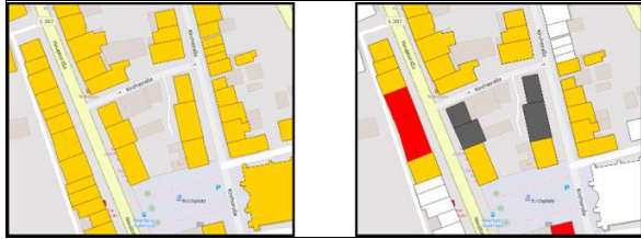
Figure 3. Example of insufficient disaggregation (left: zoning plan evaluation, right: census disaggregation), Map Tiles by Stamen Design, CC BY 3.0 Data from OpenStreetMap, ODbL.

areas, the map section shown can be ruled out as a possible match. Although it was possible to disaggregate a section of buildings on the left edge of the grid cell (see red area), it could hardly be considered an area of single-family houses. The yellow building footprints in the right-hand map section indicate the expected historic buildings from 1949 and earlier.