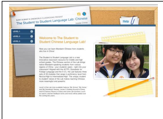
Figure 1. Language Lab Interface