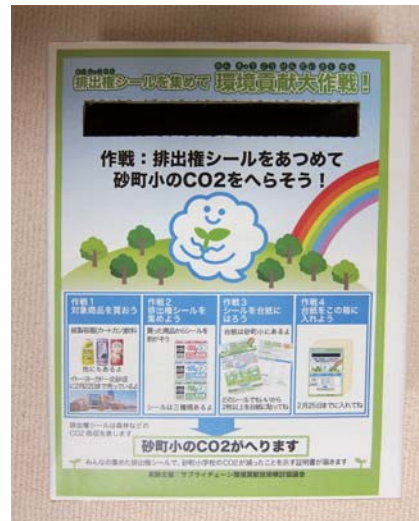
Figure 3. RFID tag/barcode seal collecting box

The supermarket totally sold 5320 cans, where the sales volumes of cans with carbon credits in two weeks was three times more than usual at the supermarket. Thirty-five percent of RFID tags or barcodes were returned to the supermarket by customers who claimed the credits. About 750 tags among them were donated to the school through our approach. There were many lessons learned from the experiment, but most problems in the experiment were not