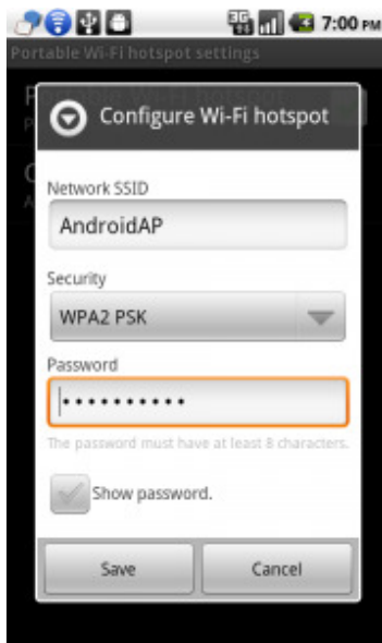
Figure 1. Wi-Fi host spot on Android

Especially, we would like to point attention to the most interesting (by our opinion, of course) use case: Wi-Fi hot spot being opened right on the mobile phone. Most of the modern smart phones let you open Wi-Fi hot spots. We can associate our rules to such hot spot (hot spots) and so our messages (data snippets) become linked to the phones. Actually, we are getting dynamic LBS here: phone itself could be moved and so, the available data will be de-facto moved too.