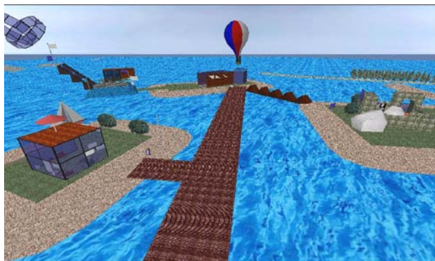
Figure 1. 3D visualization of social structure of a learning community as 'Archipelago'

In Table 1, we provide an overview and compare social awareness mechanisms in Active Worlds and Second Life (based on the presented 2 studies), along the dimensions of learner , place , artifacts , following a characterization framework developed earlier by the author [2].