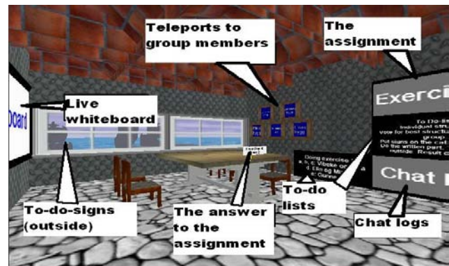
Figure 2. A virtual place with visualizations and traces of students' discussions and activities.