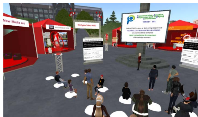
Figure 4. Examples of 3D visualizations of community's activities: Virtual Science Fair, exhibition booths presenting research projects and seminars