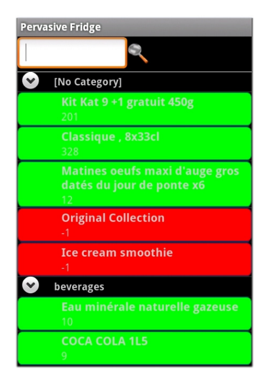
Figure 3: List of managed products

An internal reminder is also activated each day at a parameterized hour, while a vibration is activated on the device, and a pop-up invites the user to see what products are expired.