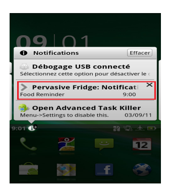
Figure 6: Internal reminder of Pervasive Fridge

In the following lines, we give some information about the reactive and proactive received notifications in this experiment. The reactive notification way is traditional in this kind of applications. It means that the user ask voluntarily the system about the expirations date of the food stored in the system. In reply, the application indicates to the user, with a graphical internal reminder message (see Figure 6) and a vibration of the device.