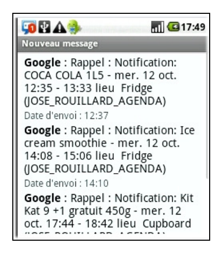
Figure 8: SMS Notification for Coca-Cola, Ice Cream and Kit Kat

Thus, we provided the possibility to push some important information to the user, even if the Pervasive Fridge application is not activated at the appropriate moment. Finally, Figure 8 presents a screen capture of a SMS notification received freely by the user on his/her phone. We strongly believe that these kind of proactive messages, emanating from our Pervasive Fridge system, are very useful in the fight against uneaten food loss.