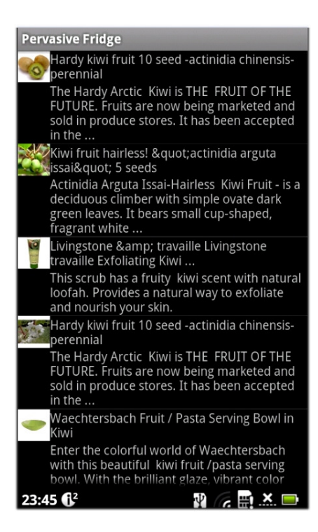
Figure 5: Kiwis, identified by a photo of the product

These products were composed of foods and beverages. We tried to use barcode, voice, photo and text to identify products and to enter expirations dates. Thirteen products have been bought the 21^{th} of September 2011. Here is the list of these goods, sorted by expiration deadline: a piece of pork (23/09/2011), a Pack choy vegetable (25/09/2011), a pack of Kiwis (27/09/2011), a Chinese cabbage, some tomatoes and bananas (28/09/2011), 4 chocolate creams (29/09/2011), 6 eggs (13/10/2011), a bottle of milk (17/12/2011), a large bottle of Coca-Cola (30/12/2011), a pack of beer (25/10/2012), a bottle of mineral water (01/03/2013) and a rice pack (06/08/2013). Five products have been successfully identified by scanning their barcode and thanks to the Prixing database: the bottles of water and milk, the eggs, the beers and the rice. One product has been successfully identified by pronouncing its barcode: the Coca-Cola. This operation was a little bit longer because it worked after a few tries and by pronouncing the barcode numbers, three by three such as, for instance: 317 - 478 - 000 - 043 - 1.