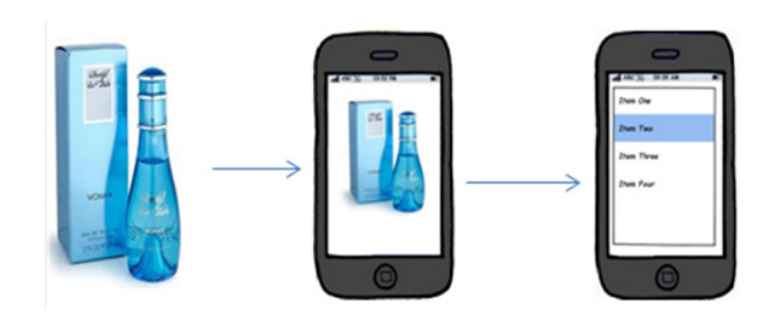
Figure 2: Identifying product by a photo

In Pervasive Fridge, the deadline of the product can be entered by different means: directly by text or voice, or indirectly, with an estimated date, depending on the category of the product.