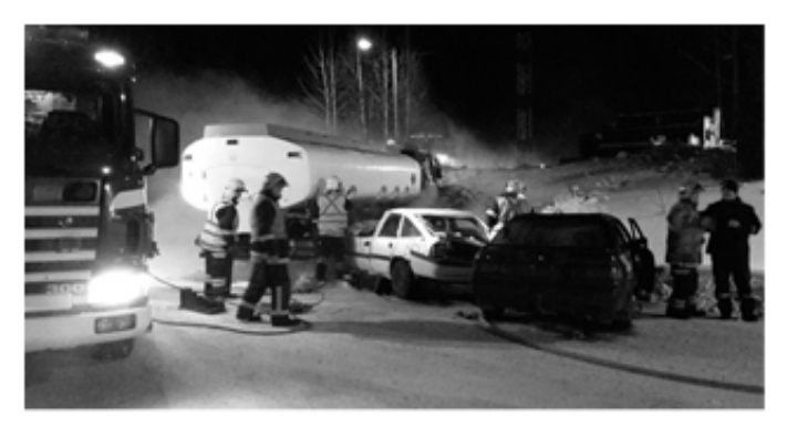
Fig. 2. A photo of an emergency situation tweeted by a citizen

Showcase description: The showcase consisted of three simulated scenarios: Hazardous material accident in Finland nearby Finnish Russian border area, where a tank wagon of a freight train containing ammonium was leaking at the rail yard. The second scenario was an aviation accident in Helsinki-Vantaa airport: Airbus 320's landing fell short 200 meters