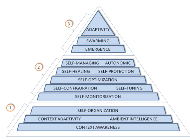
Figure 2. The spectrum of self-properties: a pyramidal representation

capability of a system to perceive its own environment and integrate in it. Pyramid #2 represents behavioral adaptation , i.e. the capability of a system to modify its behavior to adapt to different conditions, ranging from pure observation to full self-management. And pyramid #3 depicts self-adaptation , i.e. the capability of the system to manage its own adaptivity, possibly including its own emergent behavior. Together, this triple representation describes the full range of adaptation .