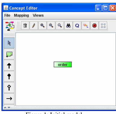
Figure 1: Initial model