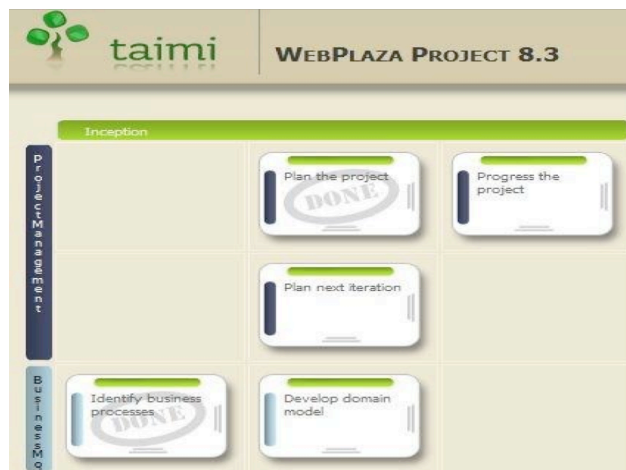
Figure 3. A project with two completed tasks