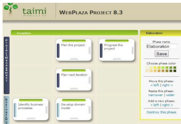
Figure 1. Adding a new phase into a process model

In Taimi, a task in a process model can be seen as a best practice with supporting templates or other guidance. The tasks can be completed with as specific or general descriptions as needed for the common benefit of the organization. The users of a process model can comment on their experiences related to the model as well as suggest improvements to the model immediately when an issue arises during a project.