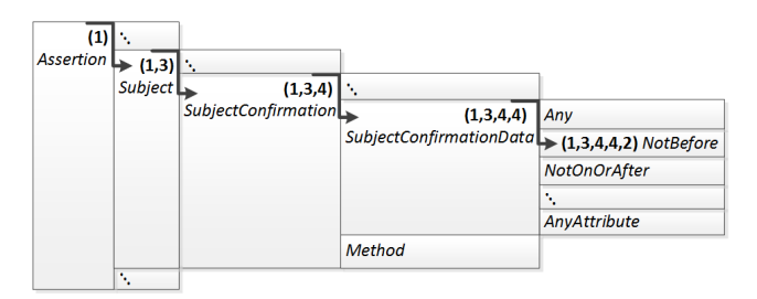
Figure 7. Navigation path within the structure component.

To keep the rules short, elements of S are referenced with tuples instead of their full names.