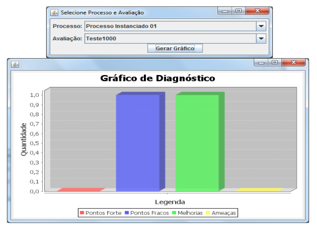
Figure 2. Screen for the Generation of the Diagnosis Chart

The following section describes the support tool that is employed to improve the software process on the basis of the appraisal results obtained.