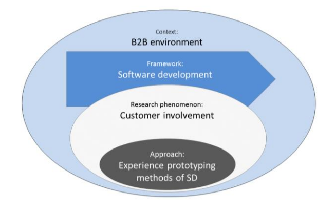
Figure 1. They key concepts and the research setting of this paper.

Several methods and facilities have been developed in order to enhance the facilitation of co-design and holistic experience prototyping. The Service Innovation Corner (SINCO) is a service prototyping environment concept developed at the University of Lapland [29]. SINCO consists of the environment and a set of tools for co-design and experience prototyping. In SINCO, technological equipment and digital material, such as photos, videos, and sounds, are used to create the atmosphere of actual service moments for prototyping and re-enactment. The SINCO set-up has two