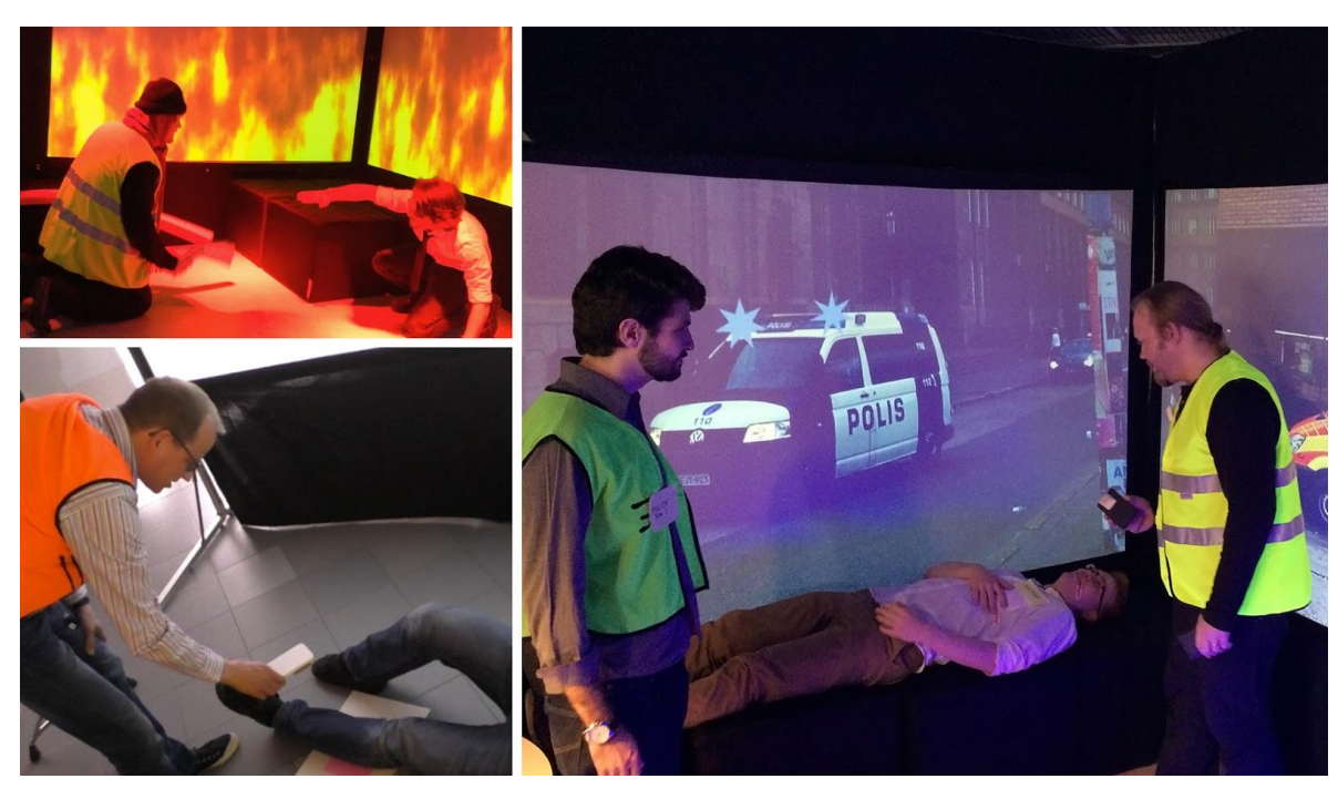
Figure 2. Example of the SD workshops: Experience prototyping public safety communication use cases in the SINCO.

Company D is a multinational bank operating on both B2B and B2C markets. The focus of the case project was to analyse and improve online banking services.