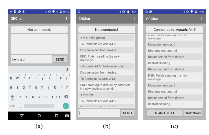
Figure 2. Several screenshots of the GRChat App.